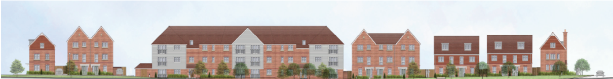
Figure 3: Whitegrove roundabout and Maize Lane (south)

9.22 With reference to Figure 3, Building A, a 3 storey apartment building (7.8m to eaves, 12.3m to ridge), provides the landmark building, which is considered to positively address the roundabout and would feature red multi stock brick and light weatherboarding materials. This would be set back from the roundabout by c.8m with a landscaped frontage comprising Beech hedging and tree planting to frame and soften, but not screen the apartment building. This building is flanked by 3 storey townhouses, transitioning to 2.5 storey dwellings (c.5.2m to eaves, 9.7m to ridge) along Harvest Ride and Maize Lane, which creates gradual variation in scale, massing and roofline. Each frontage end terminates with 'corner-turning' dwellings that positively address both street frontages. This is considered an appropriate design response leading up to the main access on Maize Lane, and along Harvest Ride, 2.5 and 3 storey dwellings would be set back c. 17m beyond a dense band of retained c.8m high Field Maples and assorted deciduous vegetation, which would appropriately define the edge, offering presence with filtered views.