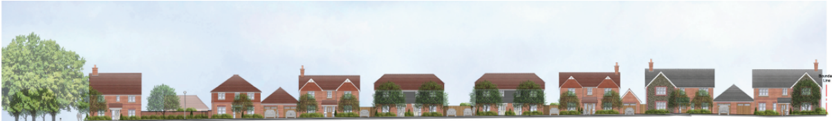
Figure 8: Dwellings backing onto properties on Warfield Street

9.36 The DAS shows that dwellings on the edge of open space should be a softer, more sensitive form of development. Development proposed here comprises more spacious, predominantly 2-storey, detached and semi-detached dwellings with sufficient setback beyond private drives and landscaping.