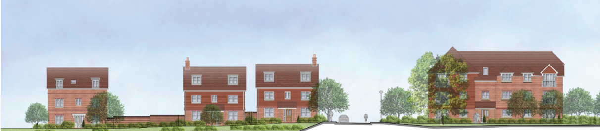
Figure 7: Principal street (north) / open space frontage

9.31 North of the spine road, access is by the secondary street which forms a transitional area leading towards the Warfield Street South character area. The southern element, bounding two areas of open space, provides for a mix of detached 2 and 2.5 storey dwellings, with a 3 storey apartment building (Building D) with a 2 storey wing. With reference to Figure 7, built form is considered to appropriately frame the entrance to the northern area, providing variation of architectural interest that positively addresses and provides natural surveillance onto the open space.