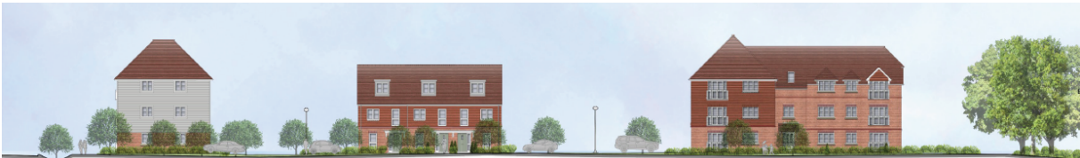
Figure 5: view south eastwards from Parcel 4 across open space

9.26 The positioning of a single terraced block between apartment buildings B2 and C, flanked by parking areas that create significant breaks in built form, combined with the varied use of materials, as shown in Figure 5, is considered to be an appropriate design response to this open space frontage.